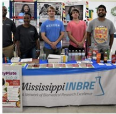
Outreach Award $3,000