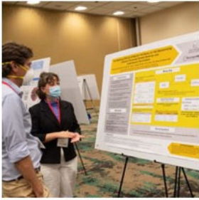
Research Hub Site Award $15,000