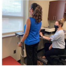
Hub Site Award $9,000