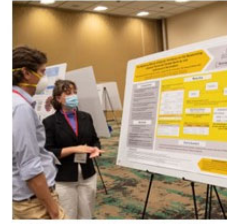
Research Hub Site Award $15,000