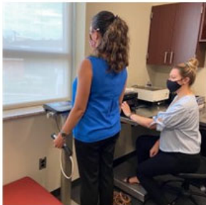
Hub Site Award $9,000