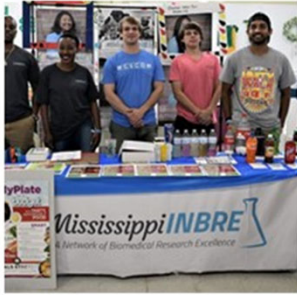
Outreach Award $3,000